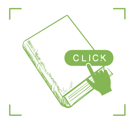
Please click on the above icon to read our previous publications

Intellectual Property, Sports & Gaming Newsletter Vol. 2 Intellectual Property, Sports & Gaming Newsletter Vol. 2 Intellectual Property, Sports & Gaming Newsletter Vol. 3 Intellectual Property, Sports & Gaming Newsletter Vol. 4 Intellectual Property, Sports & Gaming Newsletter Vol. 5 Intellectual Property, Sports & Gaming Newsletter Vol. 6 Intellectual Property, Sports & Gaming Newsletter Vol. 7 Intellectual Property, Sports & Gaming Newsletter Vol. 8 Intellectual Property, Sports & Gaming Newsletter Vol. 9 Intellectual Property, Sports & Gaming Newsletter Vol.10 Intellectual Property, Sports & Gaming Newsletter Vol.11 Intellectual Property, Sports & Gaming Newsletter Vol.12 Intellectual Property, Sports & Gaming Newsletter Vol.13 Intellectual Property, Sports & Gaming Newsletter Vol.14 Intellectual Property, Sports & Gaming Newsletter Vol.14